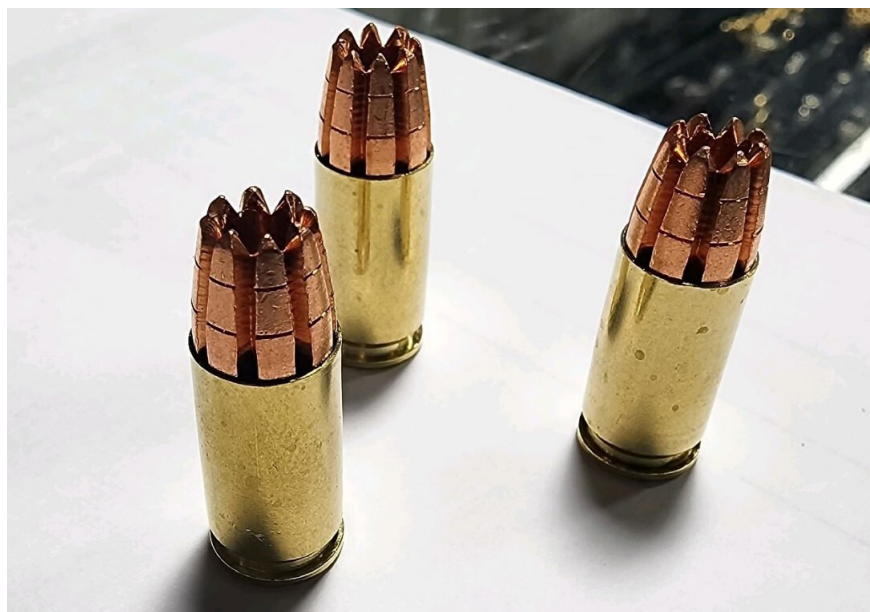
Figure 1 G2 Radically Invasive Projectile ammunition.

Though it appeared the life-threatening injuries had been addressed, the patient continued to have ongoing bleeding from the left thoracostomy. The midline laparotomy was extended across the costal margin into a left anterolateral thoracotomy. There was no hemopericardium, but numerous lacerations were evident along the parietal pleura along the spine, and there were multiple intercostal vessel lacerations. Hemorrhage control was achieved