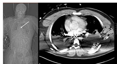
Figure 4 Torso CT. Arrows indicate radiopaque foreign body in proximity to the esophagus.

Two reports of the G2RIP round have focused on relevance to the trauma surgeon. In both prior reports, as in this report, damage control surgery was required because of the complexity of the injuries and severe physiologic derangement of the victims. Additionally, torso CT was performed after the first trauma operation to fully understand the extent of the injury and prepare for the next operation. A third common characteristic of the G2RIP round is the involvement of multiple body regions. Our patient had thoracic and abdominal involvement, as was reported by Hakki et al. 5 Iverson et al reported abdominal and proximal lower extremity involvement. 6 Although cavity penetration of the trocars depends on impact location, tissue composition, and ballistic variables, it is worth noting that the trocars do have the potential to cause massive organ damage in multiple cavities.