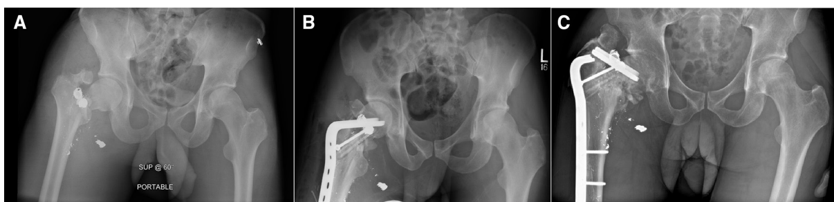
Figure 1 (A) Preoperative anterior-posterior (AP) pelvic radiographs demonstrating a right ballistic femoral neck fracture with obliteration of the entire neck. (B) Immediate postoperative AP pelvis radiograph after treatment with a vascularized fibular graft femoral neck reconstruction stabilized by a blade plate. (C) Final 3-year follow-up radiographs demonstrating non-union with hardware failure. The patient did not have any interval follow-up and did not elect revision operation.

The results of our study demonstrate that ballistic femoral neck fractures had very high complication rates and poor outcomes.