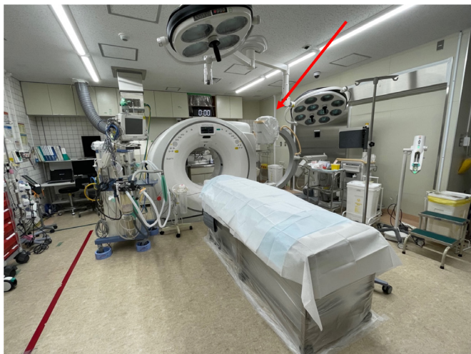
Figure 1 Overall view of the CTCARM. The patient resuscitation table is combined with a 64-helical CT scanner and C-arm fluoroscopy (red arrow). This system allows us not only to perform CT scanning but also emergency surgery, including thoracotomy and laparotomy, without transferring the patient. Although C-arm fluoroscopy is not the resolution required for interventional radiology procedures, we can perform essential cannulation of arteries or veins with the guidance of this fluoroscopy system. CTCARM, CT and C-arm combined resuscitation room system.

without patient transfer, offer the potential for innovation of bleeding control strategies, algorithms, and time processes for managing pelvic trauma. 8,9