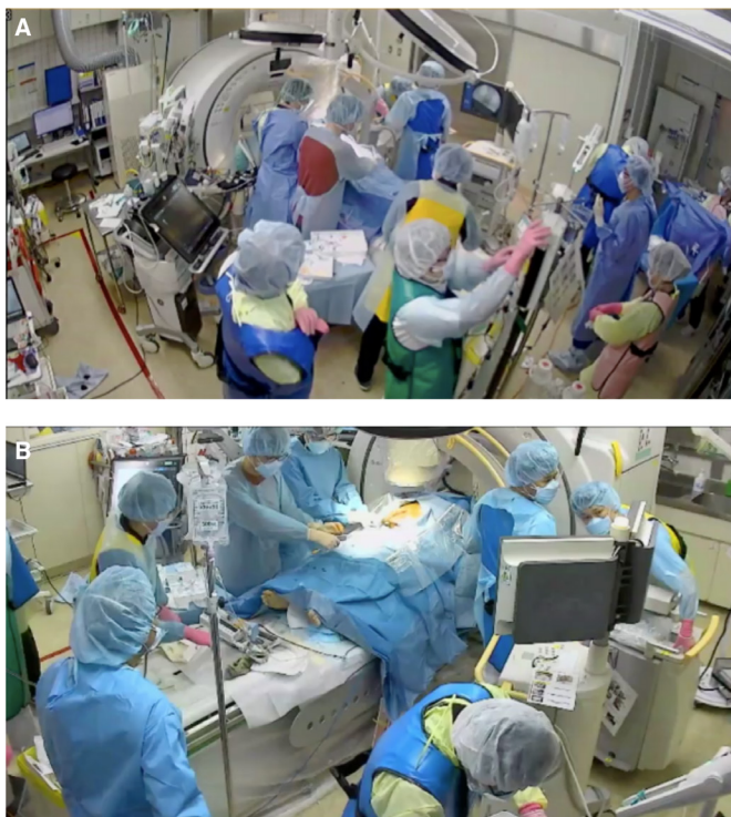
Figure 2 (A,B) The pictures of actual REBOA insertion scenes for pelvic trauma patient. And after the placement of REBOA, we rapidly implemented laparotomy on this bed for the concomitant intra-abdominal bleeding without patient transfer. REBOA, resuscitative endovascular balloon occlusion of the aorta.

without patient transfer, offer the potential for innovation of bleeding control strategies, algorithms, and time processes for managing pelvic trauma. 8,9