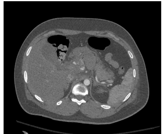
Figure 2 Axial slice of the CTA abdomen of the ruptured hepatic artery pseudoaneurysm.

A REBOA was placed in the intensive care unit and he was emergently taken to the OR for an exploratory laparotomy. A large, peripancreatic hematoma precluded dissection of the common hepatic artery origin. Furthermore, the celiac axis was known to originate from behind the pancreas on his preoperative imaging. Once the area was packed, the REBOA was deflated and the site