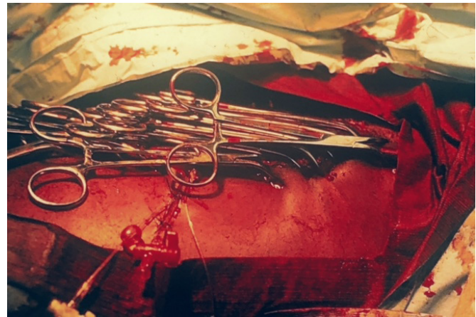
Figure 3 Towel clip closure to cover open left groin wound and shunt except T-piece.

multiple pellet wounds was controlled by resection of an injured segment of a major artery (CFA/SFA) and ligation of a major vein (CFV). Second, after passage of Fogarty balloon catheters proximally and distally, a temporary intraluminal shunt was inserted to restore arterial inflow into the extremity. Third, with edema of the left lower extremity from ischemia and ligation of the CFV, a ‘prophylactic’ (no compartment pressure measured) two-skin incision four-compartment fasciotomy was performed in the left leg. 8 And, fourth, a temporary towel clip closure of the defect in soft tissue/incision in the left groin was performed to cover the intraluminal shunt.