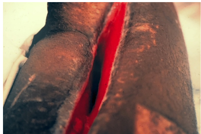
Figure 4 Granulating open left groin wound at time of discharge on 39th postinjury day.

The choice of a small size PTFE graft for the extra-anatomic bypass would be criticized by most vascular trauma surgeons in the current era. The first reason is that PTFE prostheses are