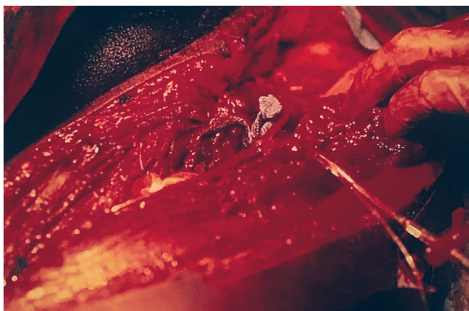
Figure 2 Pruitt-Inahara intra-arterial shunt connecting left common femoral and superficial femoral arteries in groin wound.

The fundamental principles of ‘damage control’ for vascular trauma were all applied in this patient. 7 First, bleeding from