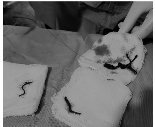
Figure 3 Blood clot removed from the pulmonary artery during catheter-directed thrombectomy.

hematoma. Additional X-rays noted bilateral radial fractures and right femur fracture. The patient was admitted to the surgical intensive care unit (ICU) for hemodynamic monitoring, serial laboratory evaluation with abdominal examination, and further management of multisystem injuries. After stable head CTs, pharmacologic venous thromboembolism prophylaxis was initiated on hospital day 3. Spinal fusion was performed on hospital day 5, followed by internal fixation of extremity fractures on hospital day 6.