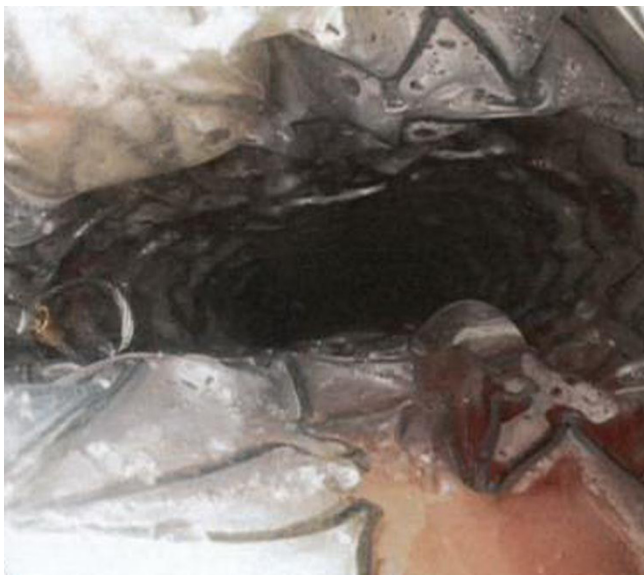
Figure 2 Esophageal stent covering area of injury.

Penetrating injury to the esophagus is encountered with relative infrequency and remains among the most challenging of wounds to manage while avoiding major postoperative morbidity. While early operative repair offers the best opportunity for success, it relies on sufficient exposure that may be technically difficult to achieve. In addition, although aggressive esophageal mobilization may improve exposure of the wound(s) requiring repair, such a maneuver may risk injury to the esophageal blood supply, resulting in devascularization. When situated at the thoracic inlet, injury to the esophagus is particularly troublesome as neither the cervical nor thoracic approach to the wound is particularly gratifying given the limited space in which to expose the injury.