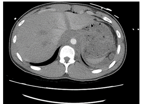
Figure 1 CT scan with liver laceration and peri-aortic hematoma.

This case describes successful endovascular repair of a penetrating injury to the liver and