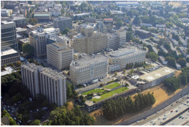
Figure 1 Aerial photo of the current Harborview Medical Center campus, Seattle, Washington.

heart surgery on the West coast was performed at Harborview by Alvin K Merendino, MD. 1