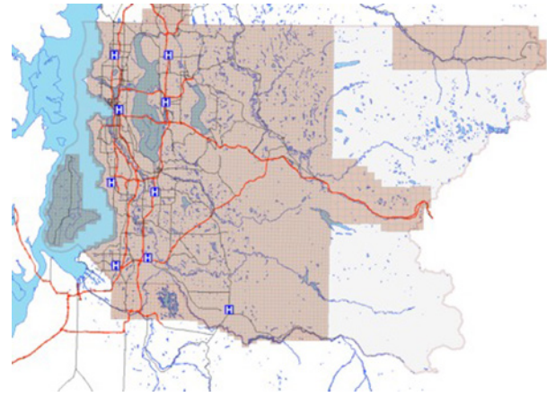
Figure 3 Geographic distribution of trauma centers in King County, Washington (central region).

This bill was passed into law as the Trauma Care Study Act of 1988 and called for the appointment by the Governor of a formal Trauma Care Steering Committee, chaired by Dr Jim Nania from Spokane, Washington. The committee was given the task of conducting a study of trauma care in Washington, developing a comprehensive trauma system plan and reporting recommendations to the Governor and legislature in January 1990, along with proposed implementation legislation. 4,5 The Steering Committee again included representatives of all the key EMS and trauma care provider groups in the state, statewide geographic representation and public representation. In addition to the committee, over 100 other interested experts within the state volunteered to participate in one of five technical advisory committees: data, prehospital, hospital, pediatric, and cost and public policy. The bill established a Trauma Trust Account funded for 2 years from the Public Safety and Education Account. This