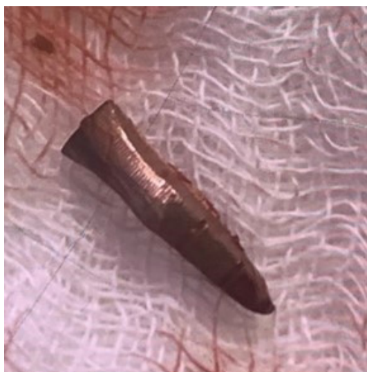
Figure 3 Foreign body from peritoneal cavity.

Ballistics of the G2RIP round made this case unique. Though there was one external ballistic injury on physical examination, radiography and operation revealed numerous projectiles. The dispersion of projectiles was wide and non-uniform. The non-uniform dispersion may be related to the non-uniform composition of the solid and hollow viscera. 3,4 As in this case,