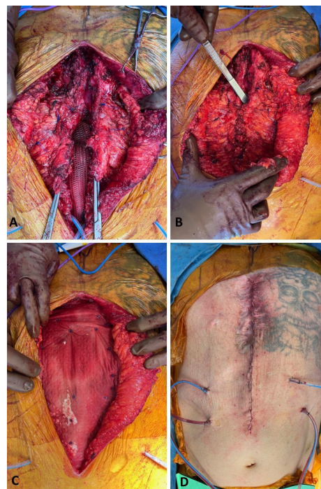
Figure 3 Completion of repair. (A) Symbotex mesh placed. (B) Anterior fascia closed over the mesh, with forceps inserted into residual sternal defect. (C) Enform onlay mesh tacked into place. (D) Closure.

of the translations (including but not limited to local regulations, clinical guidelines, terminology, drug names and drug dosages), and is not responsible for any error and/or omissions arising from translation and adaptation or otherwise.