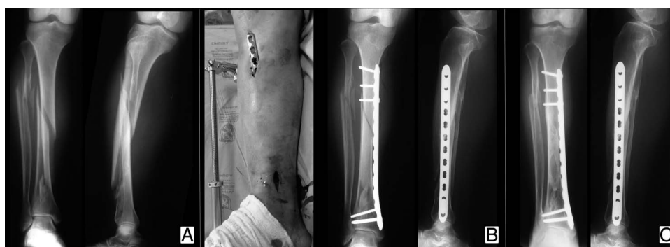
Figure 4 Indirect reduction by MIPO technique and relative stabilization using multifragmentary plate fracture 42C. (A) Complete fracture and indirect reduction. (B) Stabilization with plate. (C) Bone healing. MIPO, Minimally Invasive Plate Osteosynthesis.

statistical analysis was performed subsequently using statistical software (STATA V.12). Nominal variables were analyzed for frequencies and proportions with their respective 95% CIs; also, continuous variables were analyzed for their distribution and their averages were calculated with their respective SDs, as well as their maximum and minimum values. Finally, a descriptive analysis of consolidation time of each tibial fracture type studied (AO42) in each respective surgical technique and stabilization approach group was performed. In this study, a purely descriptive statistical analysis was performed on the use of plates in diaphyseal tibial fractures, and no comparison was made for hypothesis test analysis that generated a p value, so it was not the objective to perform a bivariate analysis and there was no control group either.