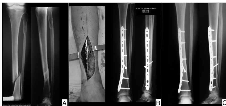
Figure 2 Open reduction and absolute stability. (A) Fracture and opened reduction. (B) Absolute stability and bone healing. MIPO, Minimally Invasive Plate Osteosynthesis.