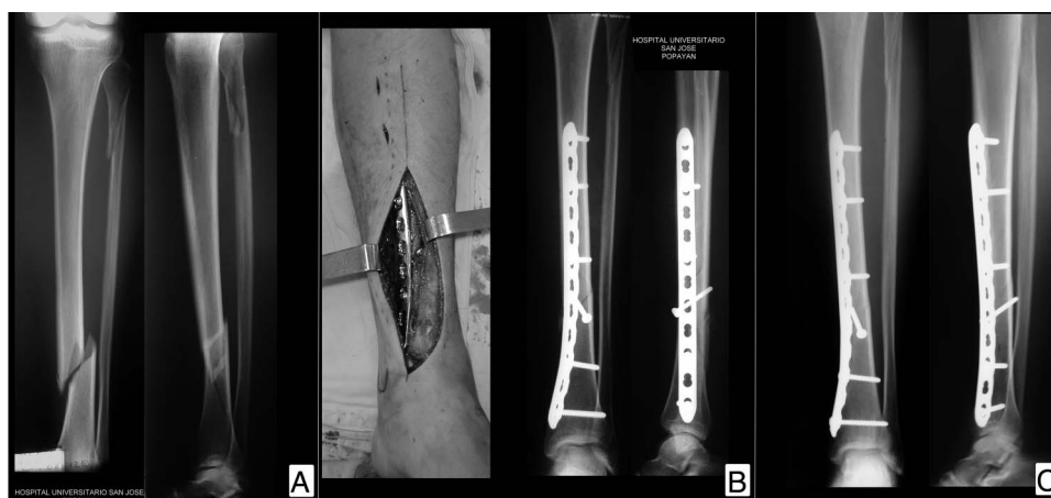
Figure 2 Open reduction and absolute stability. (A) Fracture and opened reduction. (B) Absolute stability and bone healing. MIPO, Minimally Invasive Plate Osteosynthesis.