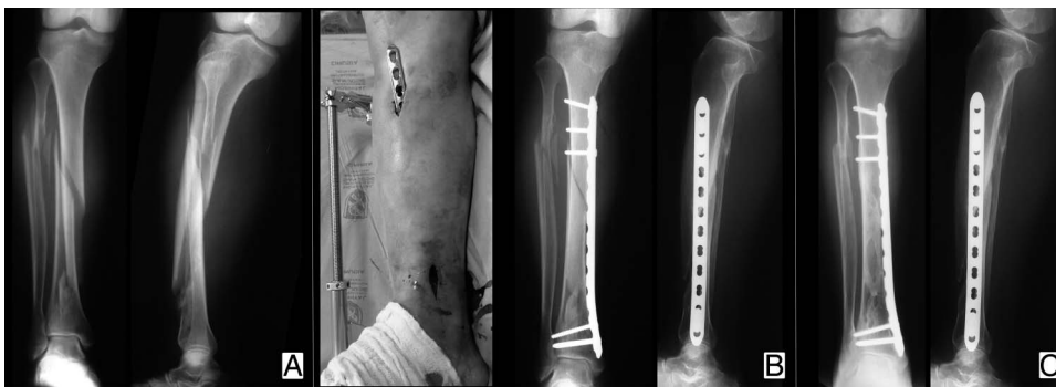
Figure 4 Indirect reduction by MIPO technique and relative stabilization using multifragmentary plate fracture 42C. (A) Complete fracture and indirect reduction. (B) Stabilization with plate. (C) Bone healing. MIPO, Minimally Invasive Plate Osteosynthesis.

statistical analysis was performed subsequently using statistical software (STATA V.12). Nominal variables were analyzed for frequencies and proportions with their respective 95% CIs; also, continuous variables were analyzed for their distribution and their averages were calculated with their respective SDs, as well as their maximum and minimum values. Finally, a descriptive analysis of consolidation time of each tibial fracture type studied (AO42) in each respective surgical technique and stabilization approach group was performed. In this study, a purely descriptive statistical analysis was performed on the use of plates in diaphyseal tibial fractures, and no comparison was made for hypothesis test analysis that generated a p value, so it was not the objective to perform a bivariate analysis and there was no control group either.