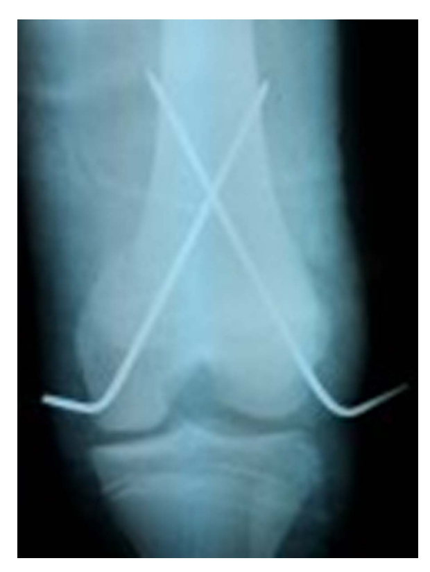
Figure 6 Case 5 post closed reduction and K-wiring AP right knee. AP, anteroposterior.

Lawal et al <sup>8</sup> described a case of a 72-year-old man who was standing with his hips partially abducted while bending down—his