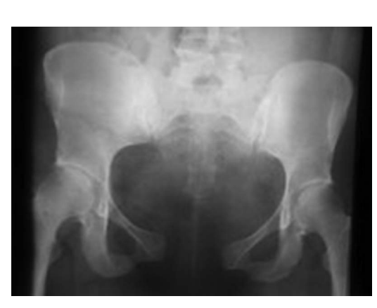
Figure 1 Case 1 AP pelvis injury film. AP, anteroposterior.

All of these patients described feeling a 'thrill' as they accelerated suddenly at a particular point during descent. This portion of the slide was