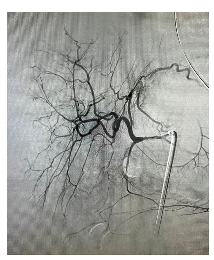
Figure 3 Angiography did not reveal any active contrast extravasation.

The management of hepatocellular adenomas is variable due to significant differences in adenoma size, location, number and presentation. Historically, resection has been used as a decisive way to remove medium to large adenomas and reduce their risk