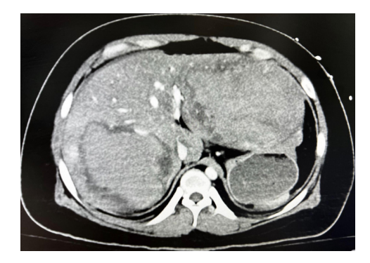
Figure 1 Axial CT image showing the large bilateral hepatic adenomas.

On clinical presentation, the patient was hypotensive at 90/60, tachycardic, and had a hemoglobin of 4.8 and a lactate of 11.66. Her abdomen was peritonitic on examination. Immediate management included resuscitation with fluids and blood to manage her hypotension.