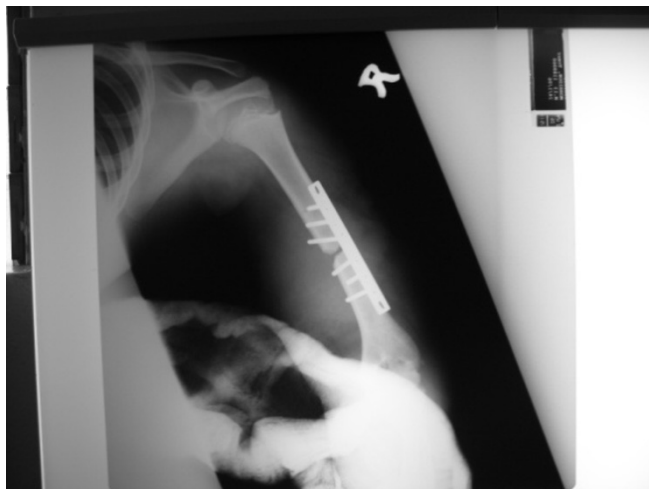
Figure 1 Day two postoperative X-rays of the right arm.

Amputations may be classified by the site of injury, type of injury (crush, sharp or avulsion) and degree of contamination and associated local injuries. 2 Amputations of the upper limb may be divided into major and minor depending on whether the amputated part has significant muscle bulk. 6 Major amputations are those at the level of the wrist or proximal, such as the index case. 6 The more proximal the amputation, the greater the muscle load 5,6 and muscle does not tolerate ischemia well. 5,6 Proximal amputations have poorer prognosis. 2,6,7 The major reason for poor outcomes of high-level reimplantation is difficulty in restoring nerve function. This may result in joint stiffness, joint instability, infection, skin and muscle necrosis. 7-9