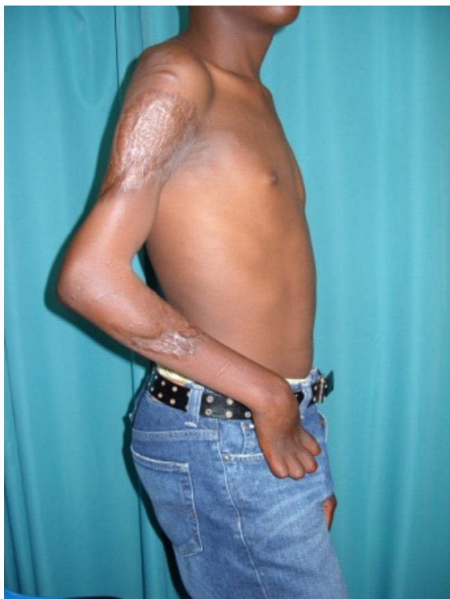
Figure 2 Lateral view of the patient 4 years postinjury.

Amputations may be classified by the site of injury, type of injury (crush, sharp or avulsion) and degree of contamination and associated local injuries. 2 Amputations of the upper limb may be divided into major and minor depending on whether the amputated part has significant muscle bulk. 6 Major amputations are those at the level of the wrist or proximal, such as the index case. 6 The more proximal the amputation, the greater the muscle load 5,6 and muscle does not tolerate ischemia well. 5,6 Proximal amputations have poorer prognosis. 2,6,7 The major reason for poor outcomes of high-level reimplantation is difficulty in restoring nerve function. This may result in joint stiffness, joint instability, infection, skin and muscle necrosis. 7-9