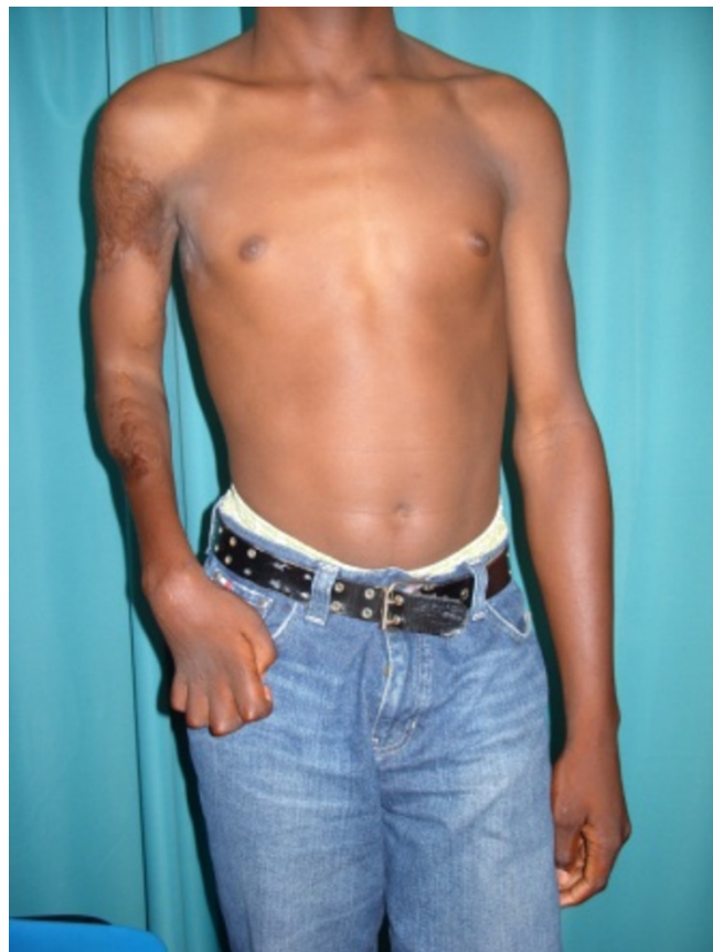
Figure 3 Anteroposterior view of the client 4 years postinjury.

Proximal amputations are also associated with an increase in the number of required secondary procedures. 6 The greater the time required for severed nerves to regenerate to the end plates, the worse the chances of recovery. 10 This factor also applies to children. 11 Saies et al 11 found that age did not affect functional outcome; however, children less than 9 years of age had a significantly higher rate of limb survival. 11