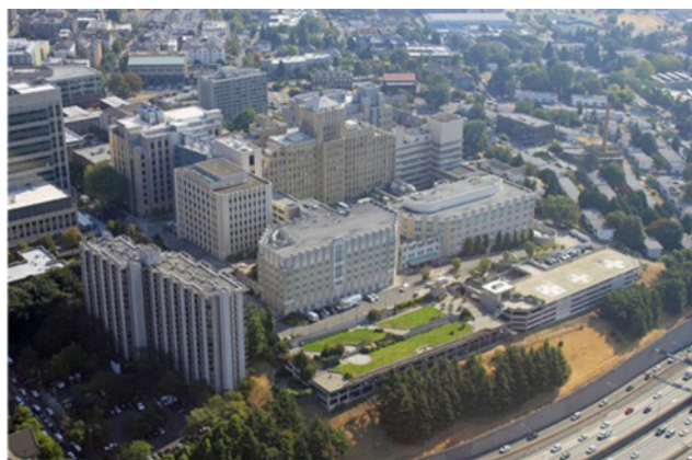
Figure 1 Aerial photo of the current Harborview Medical Center campus, Seattle, Washington.

heart surgery on the West coast was performed at Harborview by Alvin K Merendino, MD. 1