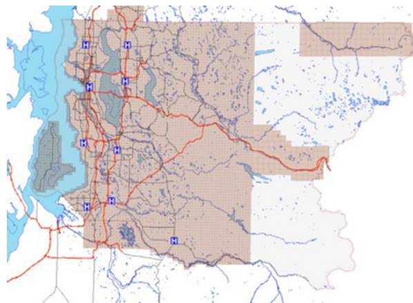
Figure 3 Geographic distribution of trauma centers in King County, Washington (central region).

This bill was passed into law as the Trauma Care Study Act of 1988 and called for the appointment by the Governor of a formal Trauma Care Steering Committee, chaired by Dr Jim Nania from Spokane, Washington. The committee was given the task of conducting a study of trauma care in Washington, developing a comprehensive trauma system plan and reporting recommendations to the Governor and legislature in January 1990, along with proposed implementation legislation. 4,5 The Steering Committee again included representatives of all the key EMS and trauma care provider groups in the state, statewide geographic representation and public representation. In addition to the committee, over 100 other interested experts within the state volunteered to participate in one of five technical advisory committees: data, prehospital, hospital, pediatric, and cost and public policy. The bill established a Trauma Trust Account funded for 2 years from the Public Safety and Education Account. This