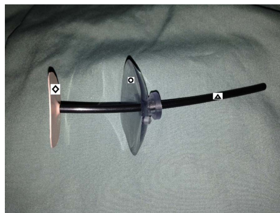
Figure 1 Components of the device: ○ silicone suction cup; ▲ flexible shaft; ◆ low-profile collapsible blood flow blocking membrane.

The new device is deployed by introducing the collapsible blood flow blocking membrane through the cardiac injury, and subsequently sliding the silicone suction cup down toward the injury on the surface of the heart (figure 2A). Thereby, abutting the membrane to the undersurface of the ventricle wall creating a firm seal (figure 2B). The device is seamlessly removed from the ventricle by sliding the suction cup upward along the plastic shaft, away from the surface of the heart, and pulling the device out of the wound. In contrast, the Foley balloon requires complete deflation before removal. The collapsible property of the inner blocking membrane maintains continuous control of the